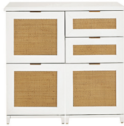
32" CREDENZA •M0567