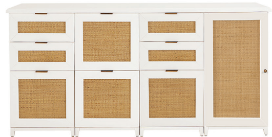
63" CREDENZA •M0573