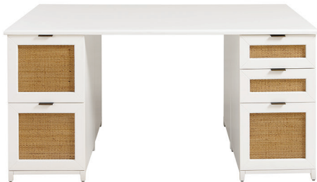
STANDARD DESK 31"H x 63"W x 20½"D •M0576

All cabinets have the same height and depth. 31"H x 20½"D