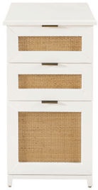
17" CREDENZA •M0566

Select any combination of cabinet bases to suit your storage needs.