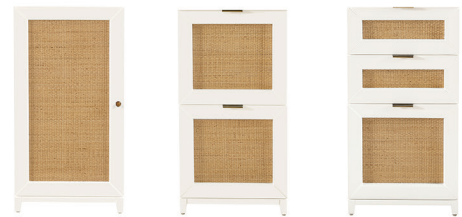
CABINET WITH DOOR

Cabinets are available in three styles. Mix and match up to four in any combination and top with a work surface to create a custom credenza. 29¾"H x 16"W x 20"D •M0570