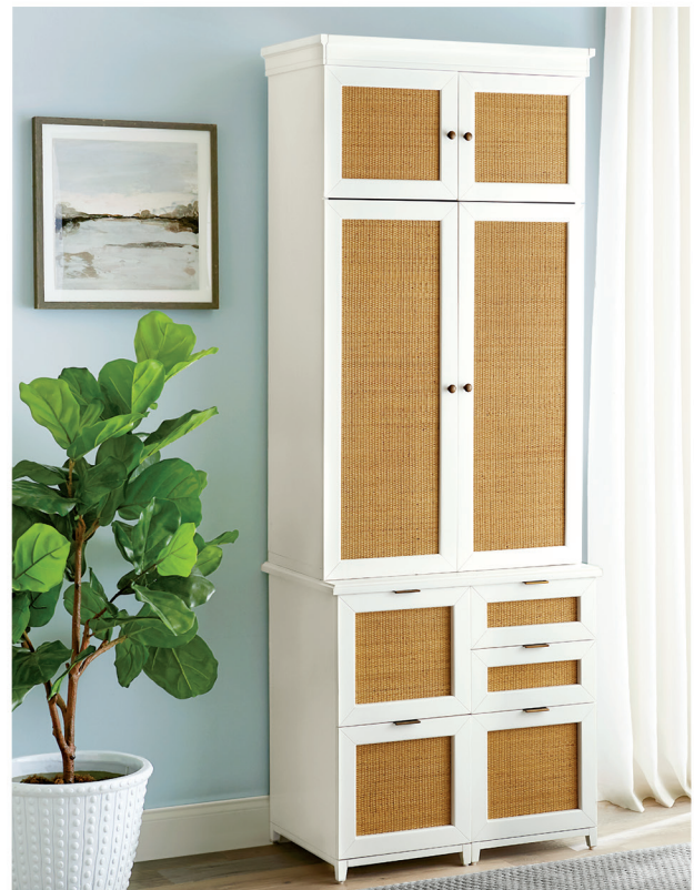
32" Credenza and Double Hutch with Doors